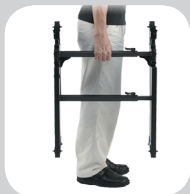
One-piece design folds up compactly.

Height: 605—930 mm (23.8"—36.6") Width: 510—850 mm (20"—33.5") Weight: 8 kg (17.6 lbs.) Load capacity: 130 kg (286 lbs.) Folded size: 685 mm x 540 mm (30" x 21")