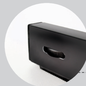
Adjustable Rubber Foot for fine height tuning and leveling.